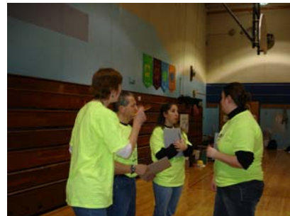
Judges hard at work